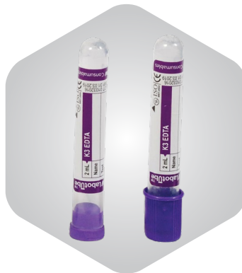
Tubes Available in Double or Rubber Cap