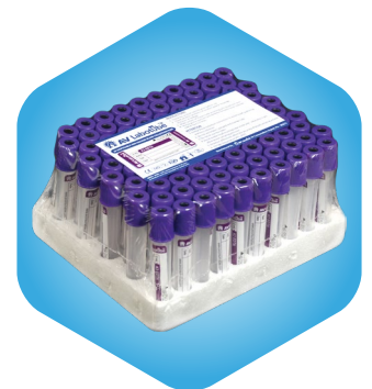
Thermocol Tray to Reduce In-Transit Breakages