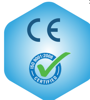
CE and ISO 9001 Certified Operations