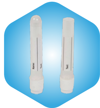
Flat and round bottom options available