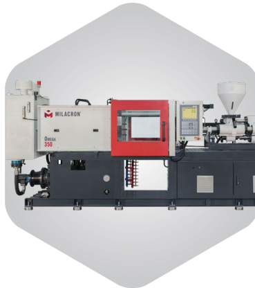
Ferromatik Milacron machine produces high quality tubes